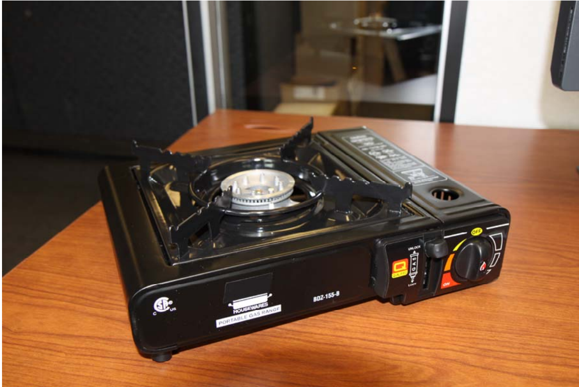
A picture of the proper way to operate the cassette cooker. With the drip pan in the upright position, hot gases can escape through the burner opening.