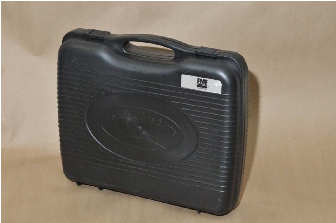
A picture of the unopened product in its plastic case.