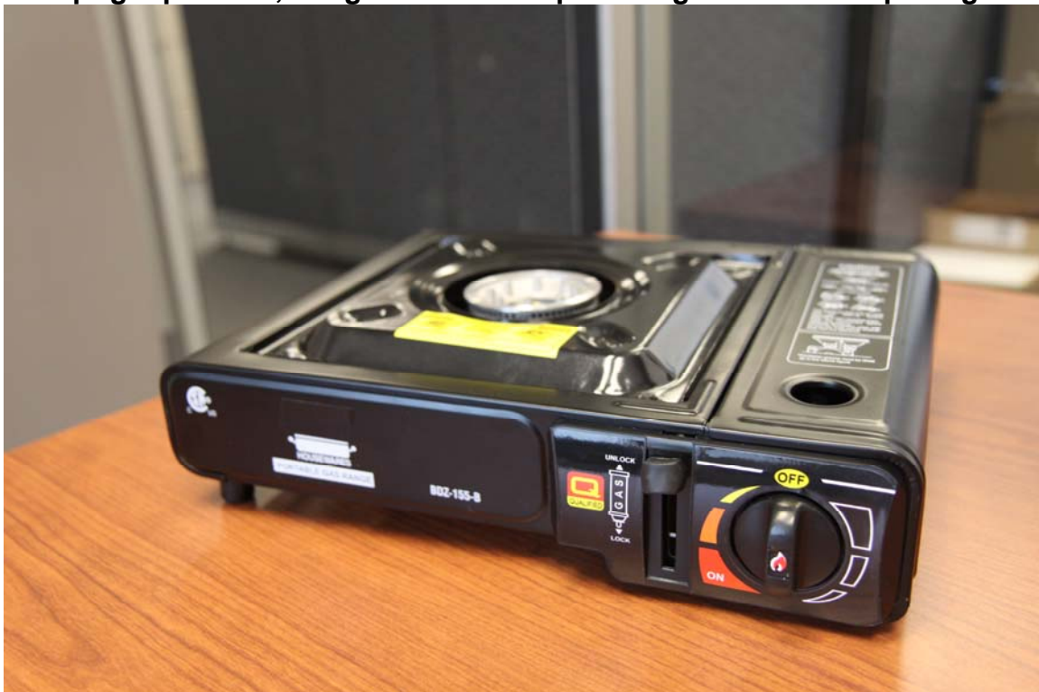
A picture of the improper way to operate the cassette cooker. With the drip pan inverted, a pot or pan can block the burner opening and force hot gases down into the appliance enclosure.